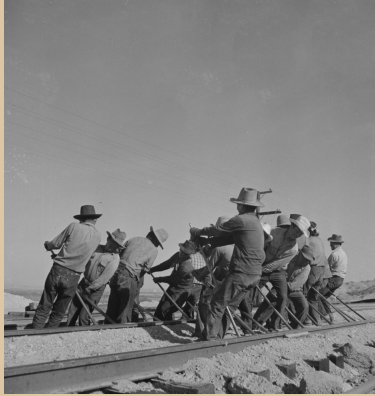
Gandy Dancers maintained railroad tracks manually in the 1900s