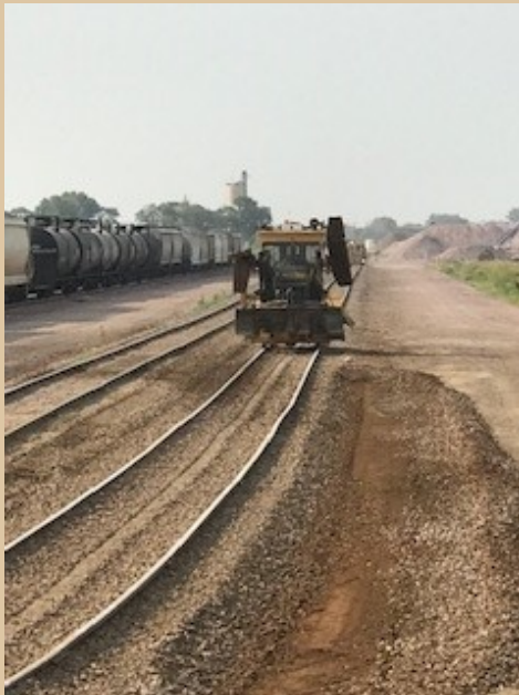
Matt Buffington grooming the trans load tracks with the ballast regulator at Hawarden

MOW replaced a half-mile of new main line track just north of Hawarden, IA.