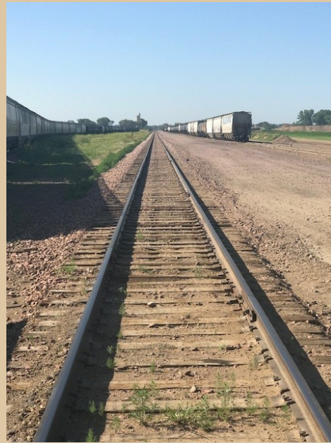
Completion of the new track